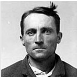
Governor, 88 Years Later, Pardons the Outspoken

TimesSelect Frontlines: Imagining Life as an Iraqi