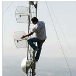
Special Section: Wireless Living