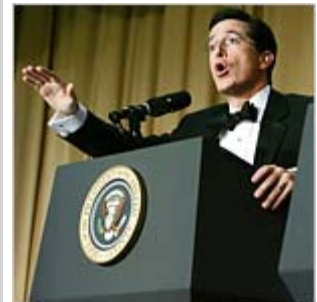
Blogsphere Is Alive With Colbert Chatter