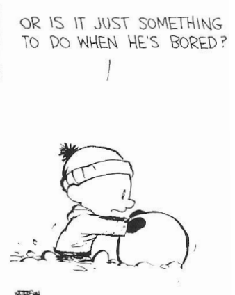
"Calvin and Hobbes" by Bill Watterson.